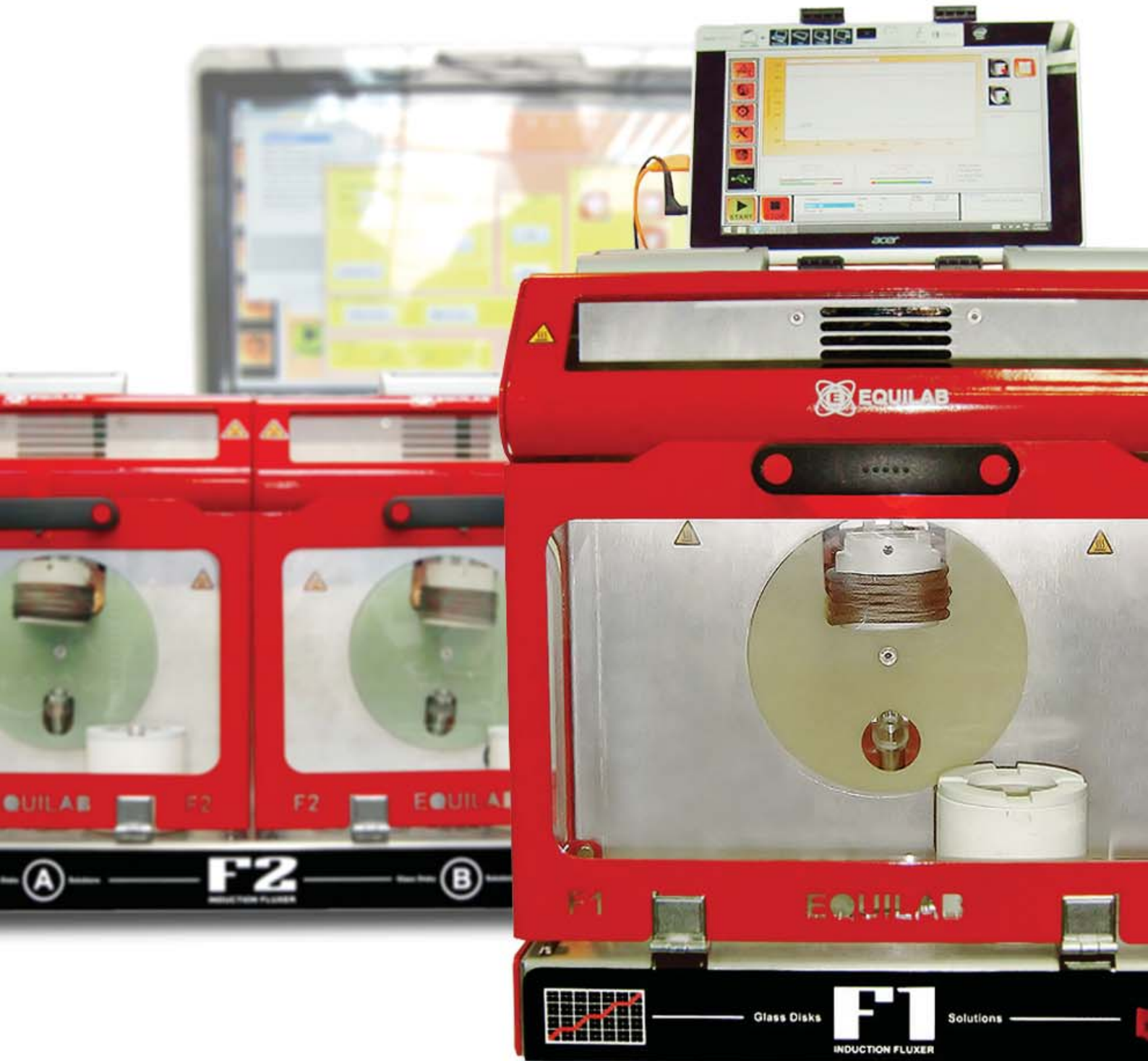
F Series Induction Fluxers